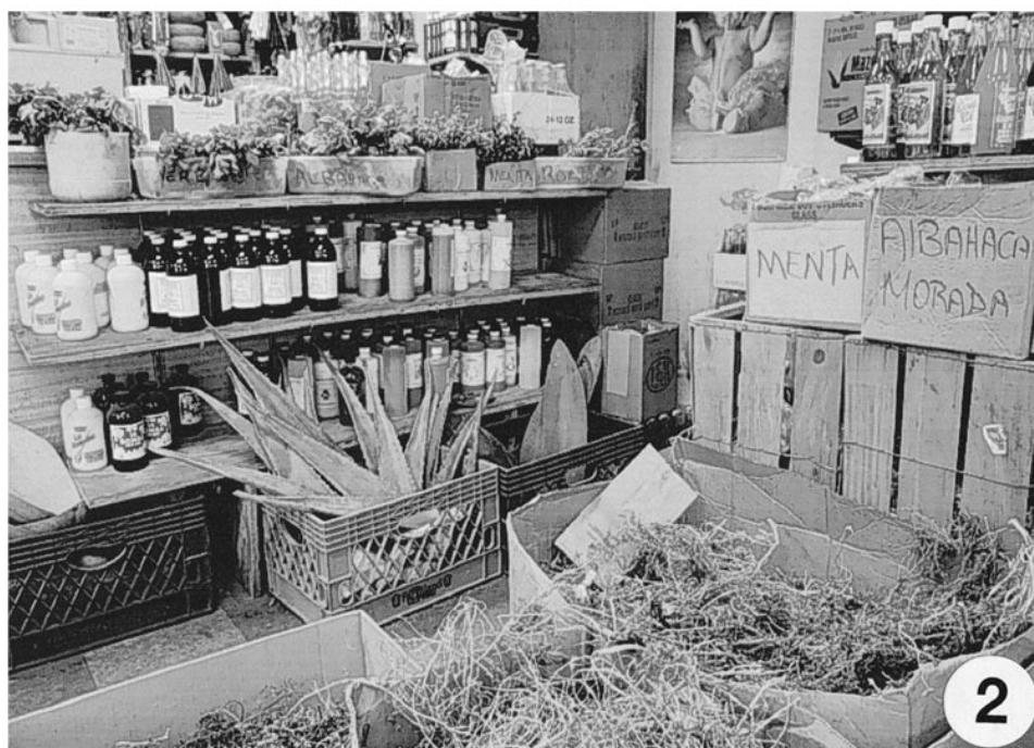
Fig. 1. A popular botánica in New York City frequented by several of the healers involved in this project. Fig. 2. Inside the botánica, fresh and dried plants sold beside perfumes and religious goods.